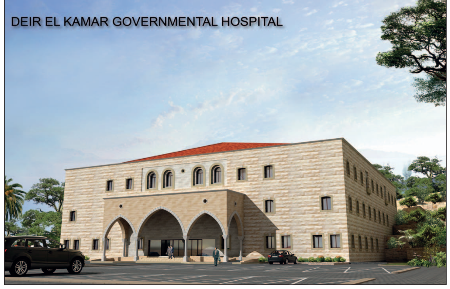
Public Hospital - Deir El Kamar

Six government health funds cover around 38% of the population, while 8% are covered by private insurance companies.