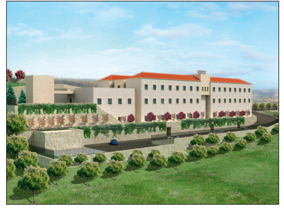
Public Hospital - Mayfouk

services, reduce the burden on families, control the increase in consumption and reduce medication prices while ensuring quality services and boosting primary health care services at a reasonable cost, lie in achieving the following goals: