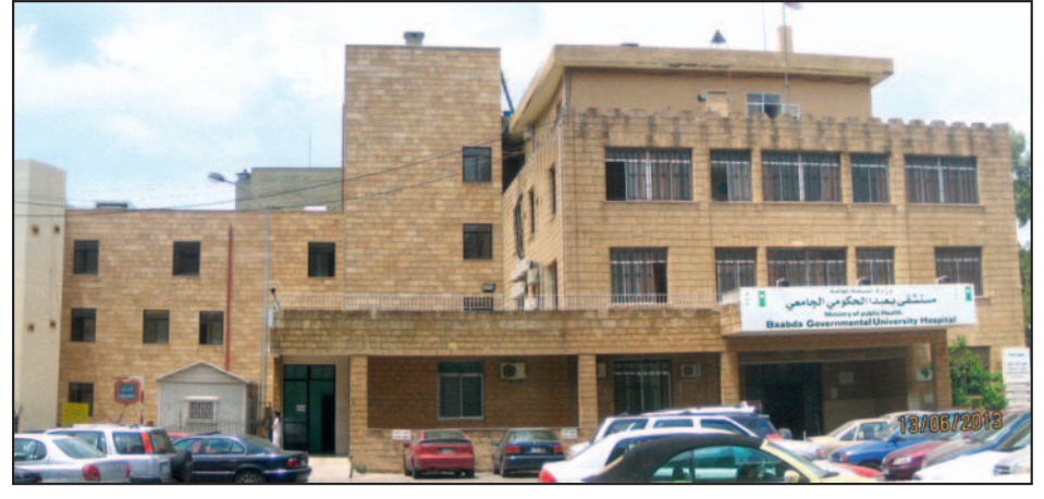
Public Hospital - Baabda

health card which is now a symbol of the efficiency and fairness of the health system. Strengthening primary health care: